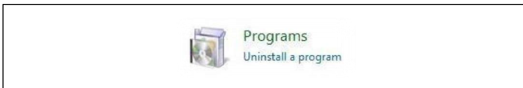
Figure 2. Uninstall a program