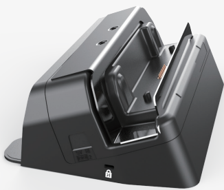
■ Kensington Lock