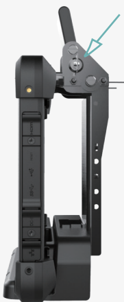
■ Key Lock