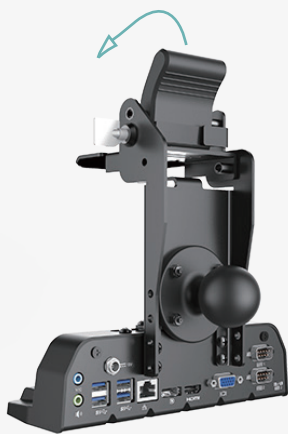
■ Quick release locking design and rich I/O ports