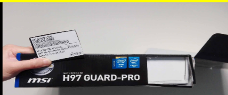
Barcode and Model Box Demo

* Clear photo including : well-cut barcode , cut-out side of model box, model name